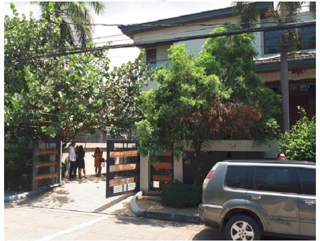
FRONT VIEWS OF SUBJECT PROPERTY