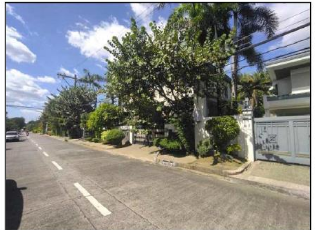
VIEWS FROM BUTTERFLY STREET